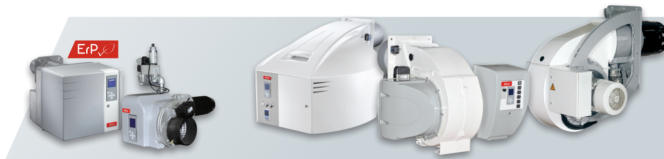
VECTRON 11 - 2300 kW

Our experience at combustion technology available in a complete range of burners from 11 kW to 80 MW: